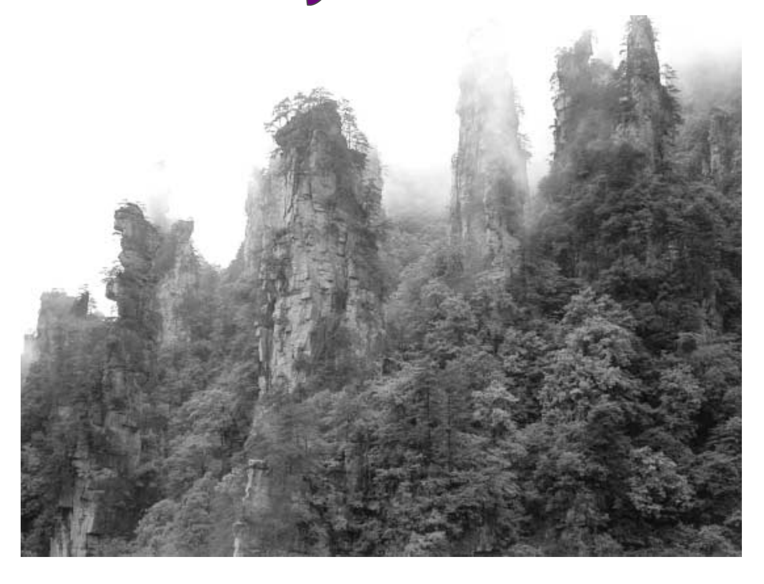
China in Transition